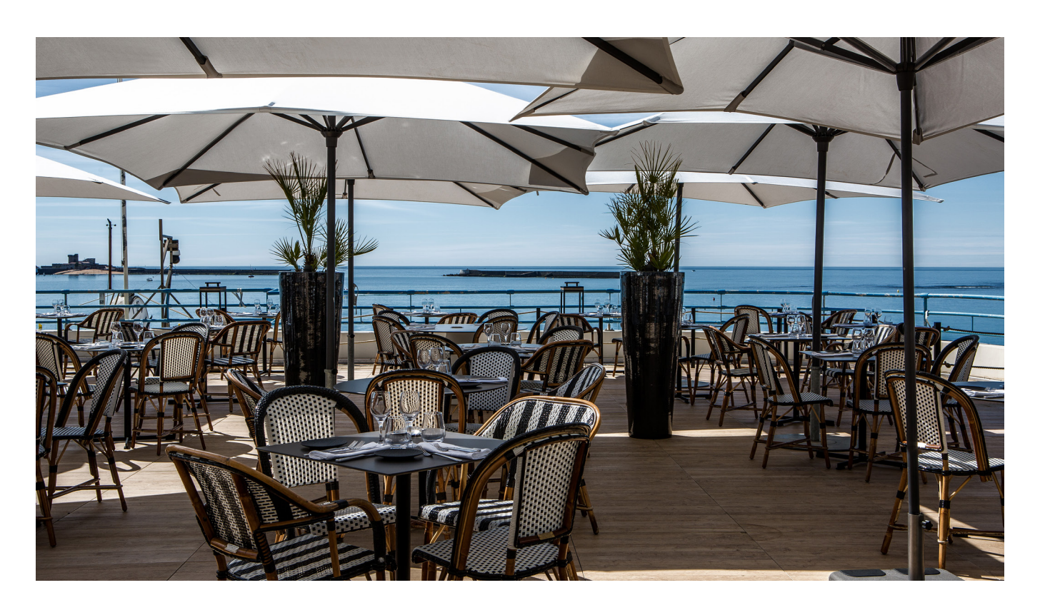
"The Hélianthal is a 1930s ocean liner moored on land."